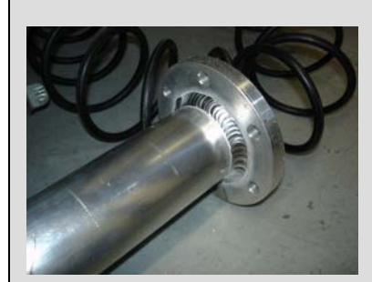
JAG patented flange system with expert TIG welding