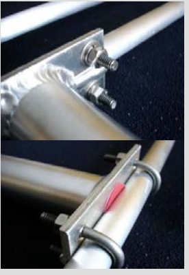
Heavy-duty dipole fixture