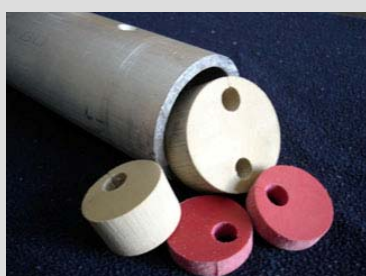
Natural rubber plugs