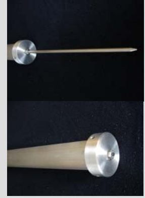
Optional lightning rod

Site-specific mounting hardware is necessary with theses antennas. Please consult JAG to determine suitable clamps for your application